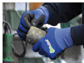
● Oily parts.