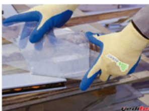
● Glass handling.