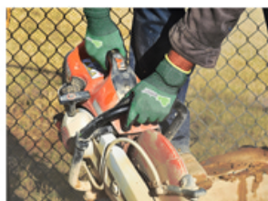
● Mechanical engineering.