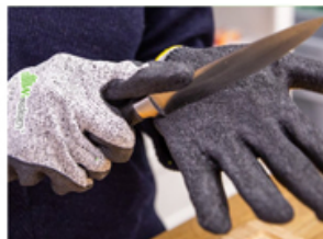
● Knife using.