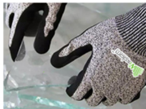
● Glass Industry.