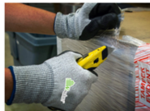
● Handling Sharp Parts.