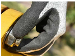
● Automotive Assembly.