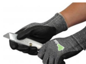
● Knife using.