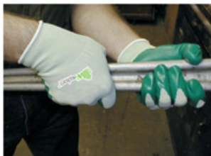
● Metal instrument.