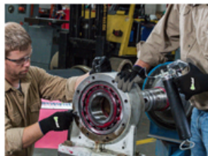
● Oily parts.