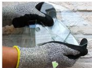
● Glass Handling.