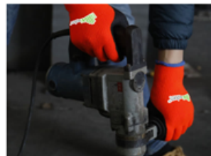
● Oily parts.