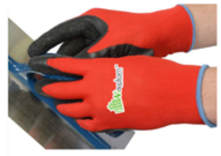
● Recycling Operations.