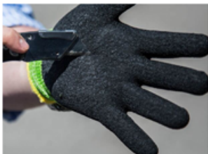
● Knife using.