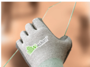
● Glass handling.