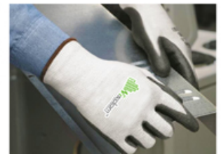
● Sharp metal.