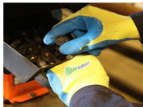
● Oily parts.