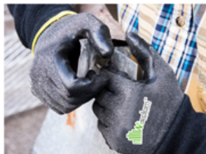
● Sharp metal.