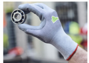
● Slip parts.