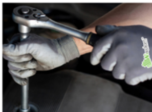
● Oily parts.