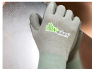
● Sheet metal.